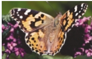
Painted Lady butterfly

From Tondy Station leave the platform via the Footbridge, turning left at the top of the steps. At the main road (known as Maesteg Road) cross the road and turn left and proceed along the pavement.