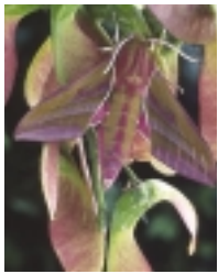
Elephant Hawk moth

Once in the woods go over a wooden stile, and follow the footpath until you see a track on your right hand side. Ignore this and stay on the lower path next to the river to a point where the path moves away from the river. Cross over another wooden stile then cross a small bridge over a stream and out of the wood. Continue straight ahead towards the stone foundations of an old farm building then with the stone wall on your right hand side continue until you see a field gate with a wooden stile along side it. Go over the stile. Keeping the tree line and river on your left hand side continue on the path. Go over a wooden stile and cross the stream at which point you will see a waymark post. Follow the track for a short distance until you see another waymark post on your left side. Follow the direction of the disc on the post so that you are heading towards an electricity pylon in the top left hand corner of the field.