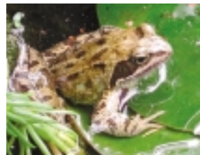
Common Frog

Tondy House Farm (4) and the surrounding woodland is currently being managed by EcoDysgu. Visitors will find themselves breathing in the freedom of 42 acres of ancient woodland, pasture and workshop space. Birds that you will find in the woodland include Great Spotted and Green Woodpeckers, Nuthatch, Treecreeper, and migrants such as Blackcap, Chiffchaff and Willow Warblers in summer. Groups of children, young people