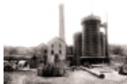
Tondy Ironworks circa 1910 and 2004

The going is easy although it may be wet in places. Remember to wear suitable clothes and good shoes/boots and take food and drink with you and be prepared to get fit! Always follow the Countryside Code and take care when crossing main roads. When you are walking on minor roads keep to the right and make use of verges whenever you can.